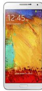
Samsung Galaxy Note3