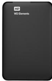
Multiple mobile hard disk

Applicable to all kinds of mobile hard disk, while supporting Samsung Galaxy, Note3, Galaxy S5 data transmission and charging function.